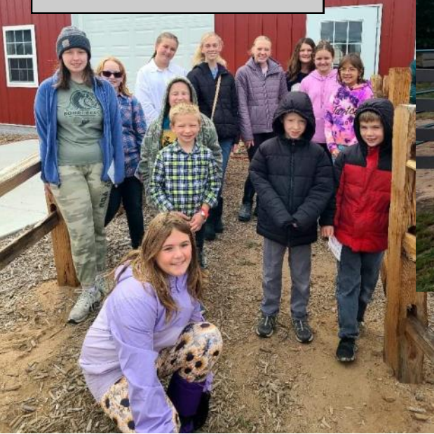
The Plover Clovers celebrated 4-H week with a visit to the Feltz Dairy Store Corn Maze.