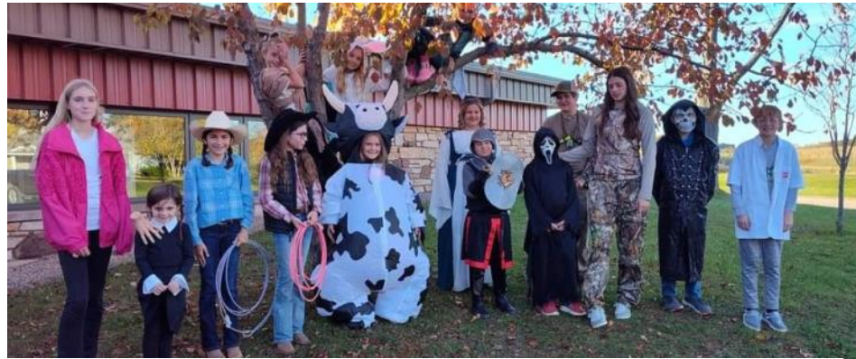
Pictured right: The Tomorrow River Voyagers in costume for their Halloween party.