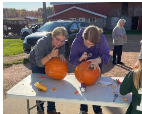
Pictured Above: Members of the Junction City Golden Stars planting flowers at Kennedy Elementary & carving pumpkins.