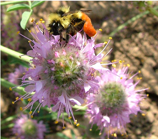
Figure 5. Hunt's bumblebee ( Bombus huntii ) visiting Blue Mountain prairie clover flowers in a common garden in Hyde Park, Utah.