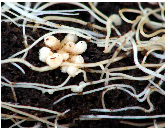
Figure 4. Root nodules on Dalea roots.

Below-Ground Relationships/Interactions. As is common with legumes, Blue Mountain prairie clover fixes nitrogen in association with rhizobial symbionts (Fig. 4) (Bushman et al. 2015).