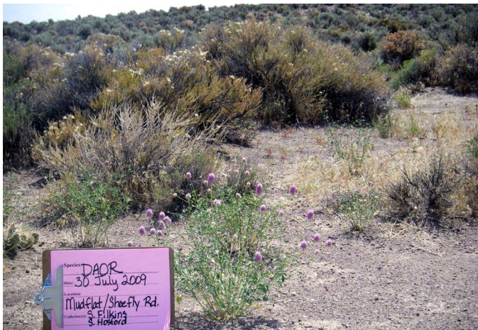
Figure 1. Blue Mountain prairie clover growing in sagebrush habitat in Idaho.

Soils. Soft clay and sandy soils from weathered basalt and volcanic ash are typical of Blue Mountain prairie clover habitats (Barneby 1977). Plants often occur on ash outcrops in Idaho and Oregon (DeBolt and Barrash 2013).