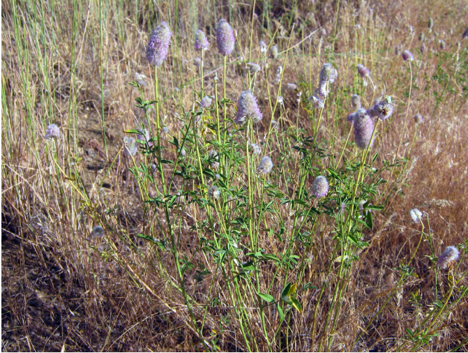
Figure 7. Blue Mountain prairie clover setting seed in Oregon.

is often immature or insect infested. Hand-stripped seed is typically easy to clean (M. Fisk, USGS, personal communication, 2018).