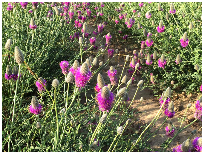
Figure 11. Blue Mountain prairie clover flowering in seed production plots growing at Oregon State University's Malheur Experiment Station near Ontario, OR.

Strong positive correlations have been reported between dry matter yield (DMY) and weight, and the number of inflorescences per plant, suggesting that selecting for high DMY would lead to greater seed yields (Bhattarai et al. 2010). For more on this common garden study, see Seed Sourcing section.