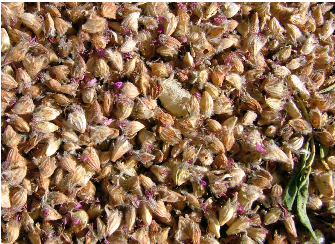
Figure 8. Bulk seed collection of prairie clover seed.

Post-collection management. Blue Mountain prairie clover is host to several seed-feeding insects. Measures to protect seed lots (Fig. 8) from insect damage are generally initiated immediately following harvest. Insecticidal strips are often placed in collection bags to reduce insect damage (Bhattarai et al. 2010). The SOS collection crews placed insecticide strips in each seed collection bag for 2 to 3 days while seed dried in open bags at room temperature (DeBolt and Barrash 2013). Seed-feeding beetles have been found in wildland and agricultural seed collections. Infestations can be detected by digital X-radiography of seed samples. There are several methods to treat insects without harming live seed. These include mechanical cleaning, fumigation, and abrupt freezing. For small wildland-collected seed lots (average size 22,800 seeds) beetles were killed with a conventional insecticide fumigant treatment of dichlorovos, which did not harm the seed (Cane et al. 2013).