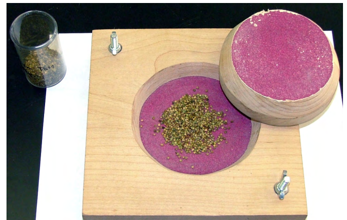
Figure 9. Apparatus used to mechanically scarify prairie clover seed with sand paper.

Germination. Blue Mountain prairie clover produces hard seeds that are physically dormant due to water impermeable seed coats. Low levels of germination (11-22%) can be expected without mechanical (Fig. 9) or acid scarification (Scheinost et al. 2009b; Bushman et al. 2015; Jones et al. 2016).