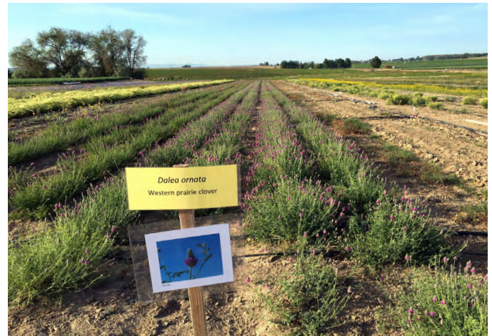
Figure 10. Blue Mountain prairie clover seed production plots growing at Oregon State University's Malheur Experiment Station near Ontario, OR.

produced in the second year and stands can be harvested for 6 years or more (Shock et al. 2017, 2018). Pollination by bees greatly improves seed yields when seed-feeding beetle populations are kept in check (Cane et al. 2012, 2013).