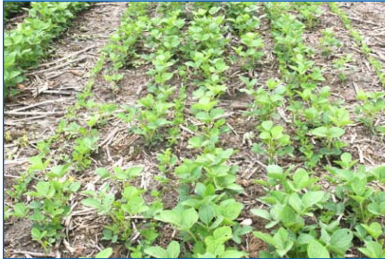
Andrew P. Robinson

If soybean stands are only thin in certain areas of a field it is a common practice to fill in those areas with a 30-inch row planter (Figure 2). Our data indicate that there is no yield advantage to filling in thin stands (66,000 or greater plants per acre) with rowed beans (Figure 3). That's because the second planting can further damage the original thin stand. Plus, the second planting's yield potential is lower because of the late planting date and faces competition from original stand. Our data show that filling in thin stands will yield the same as if the grower did nothing (Figure 4).