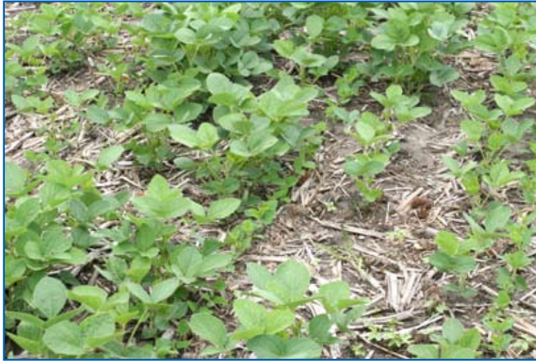
Andrew P. Robinson

Growers should consider the economics of seed input cost — about $31.50 per unit — versus the potential for another pass for weed control — $10.50 per acre (1 quart of glyphosate plus application cost). Furthermore, our research indicates that there is less than a 50 percent chance that an additional weed control pass will be needed in the thin areas as compared to the normal stands unless the area is wet and already has consistently high weed pressure.