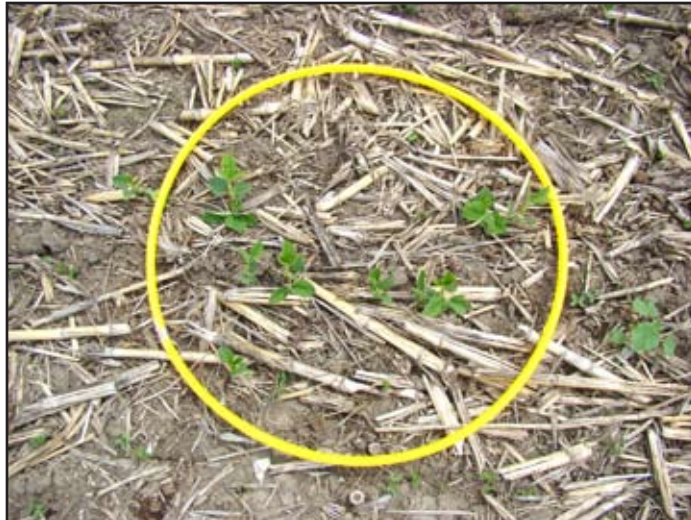
Andrew P. Robinson

Figure 1. The Hula hoop method for determining soybean stands involves counting the number of plants inside a perfectly round hoop.